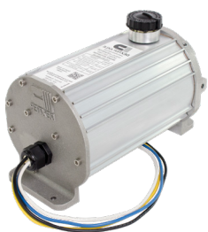
K71-650-00 Electric/Hydraulic Brake Actuator 1000 PSI