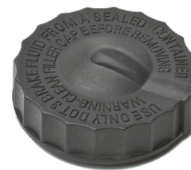
K71-685-00 Fill Cap & Gasket