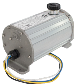
K71-651-00 Electric/Hydraulic Brake Actuator 1600 PSI